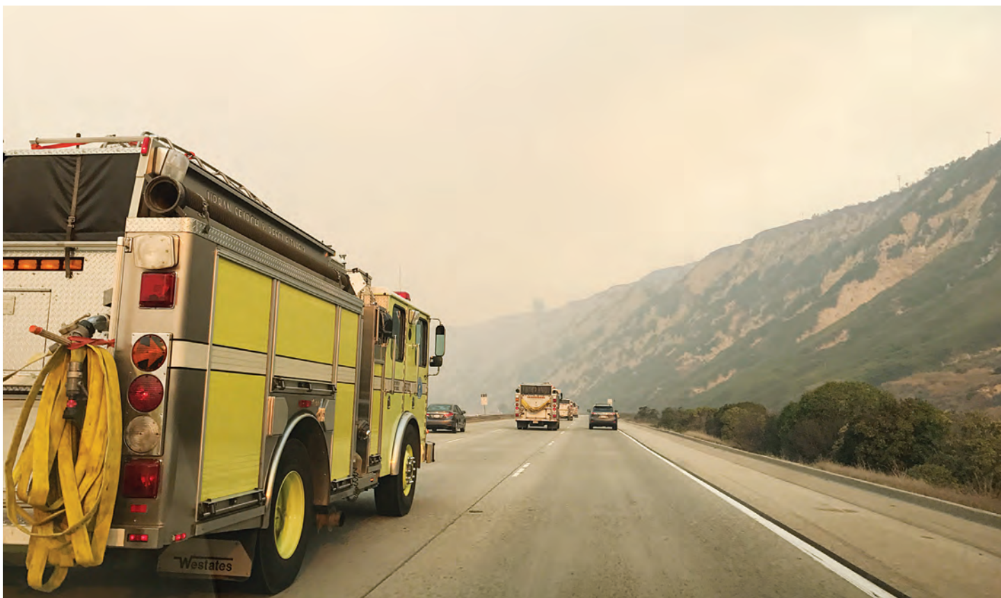
HIGHWAY 101, DECEMBER 2017