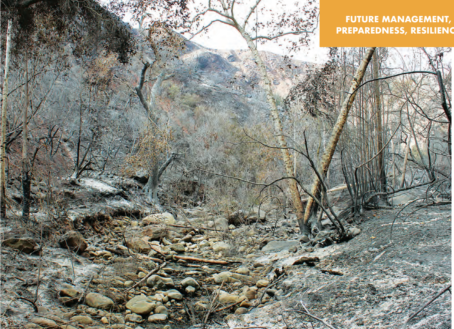
GOBERNADOR CREEK, DECEMBER 2017