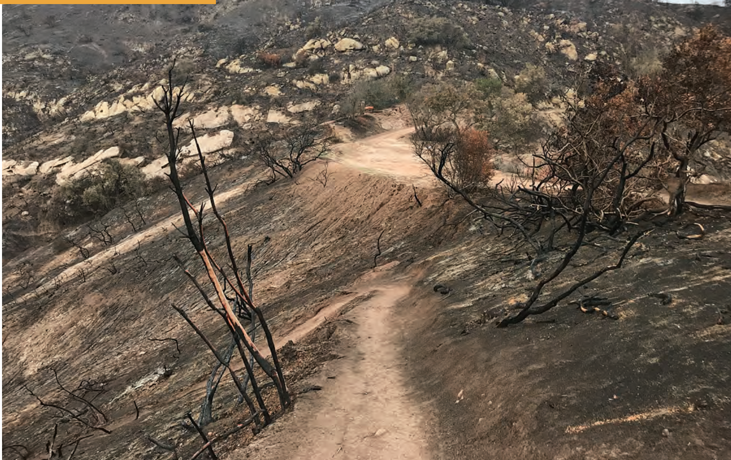
FRANKLIN TRAIL, JANUARY 2018