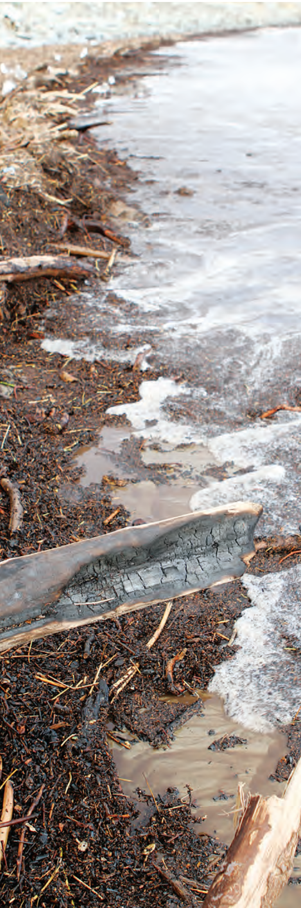
RINCON BEACH, JANUARY 2018