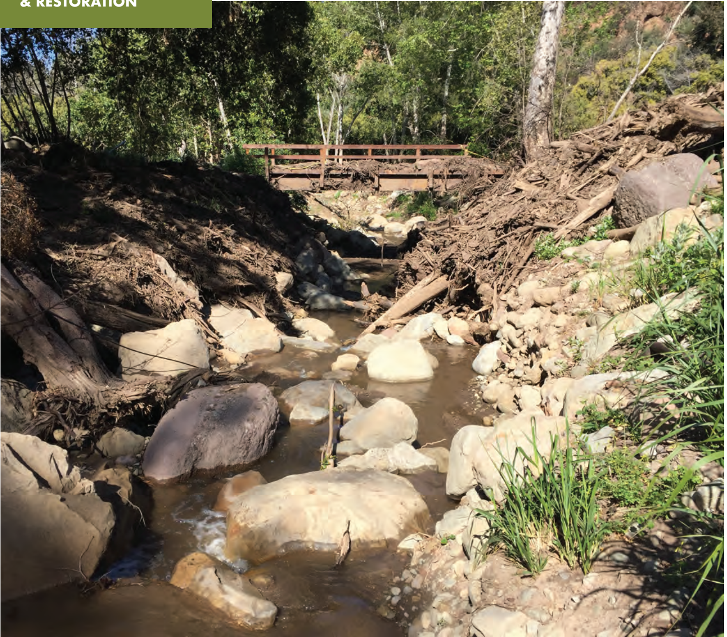
GOBERNADOR CREEK, SPRING 2018