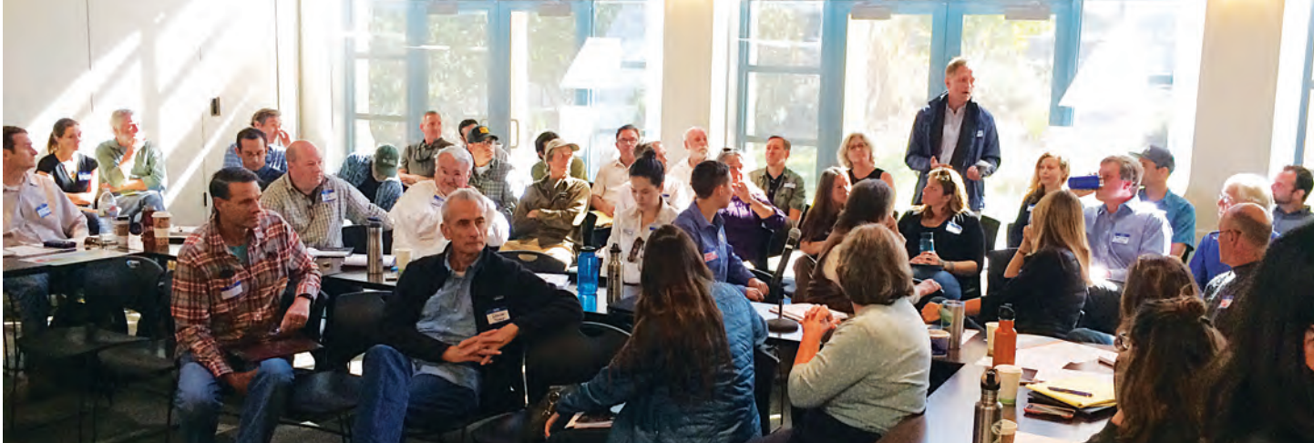
PARTICIPANTS AT THE FIRST FFF, SANTA BARBARA ZOO FEBRUARY 2018