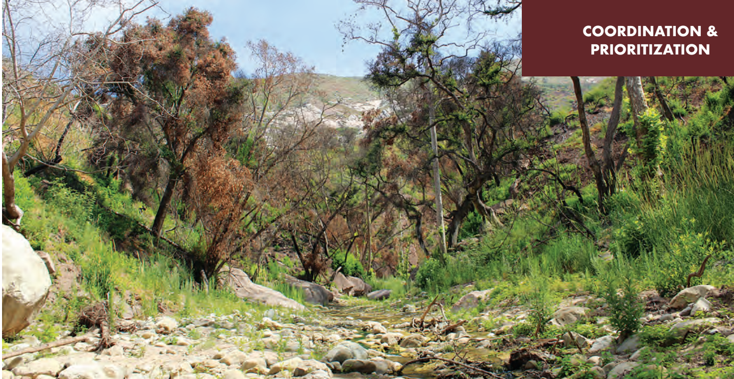
GOBERNADOR CREEK, SPRING 2018