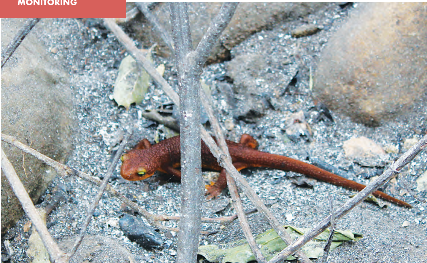
CALIFORNIA NEWT, CARPINTERIA CREEK, DECEMBER 2017