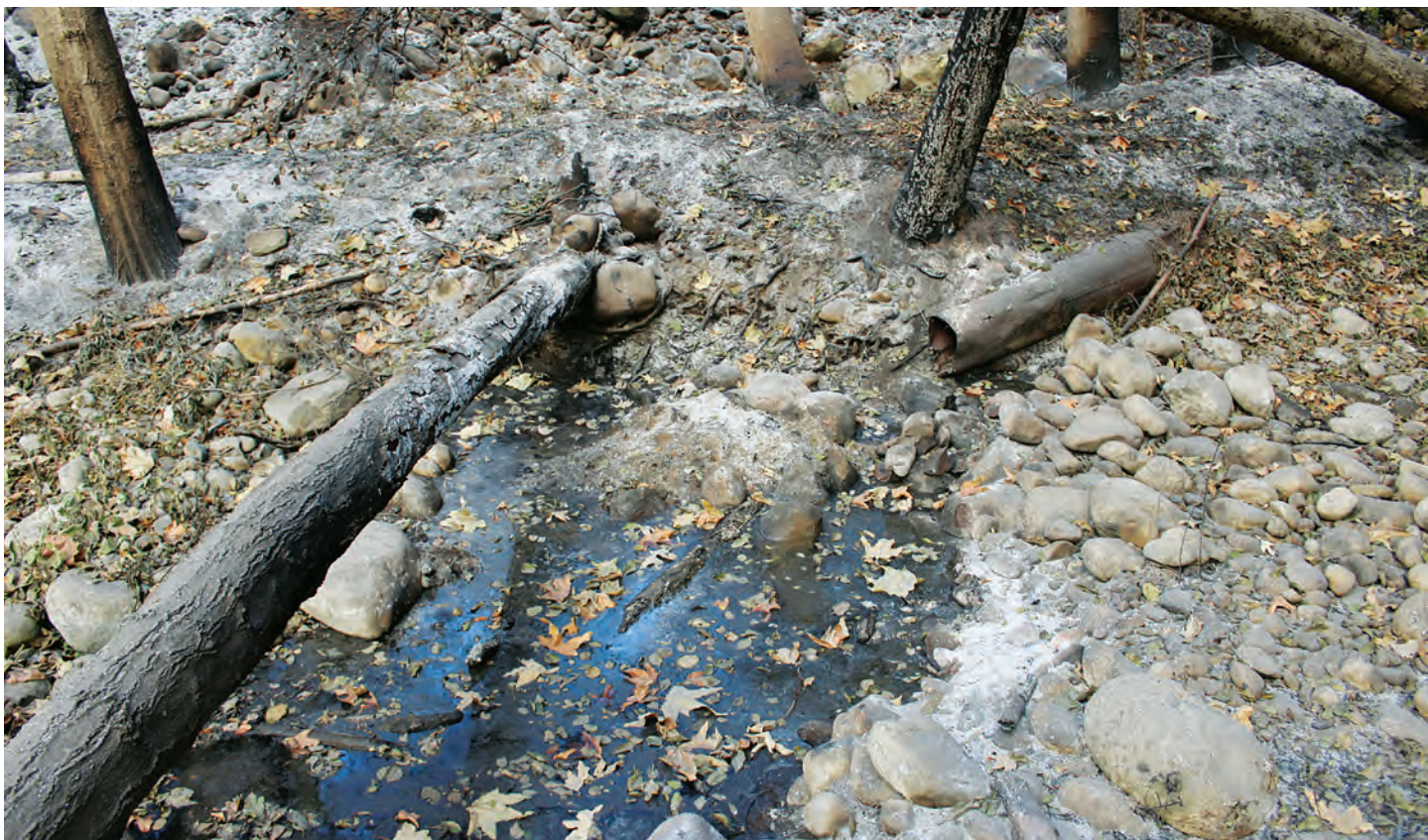
CARPINTERIA CREEK WATERSHED, DECEMBER 2017