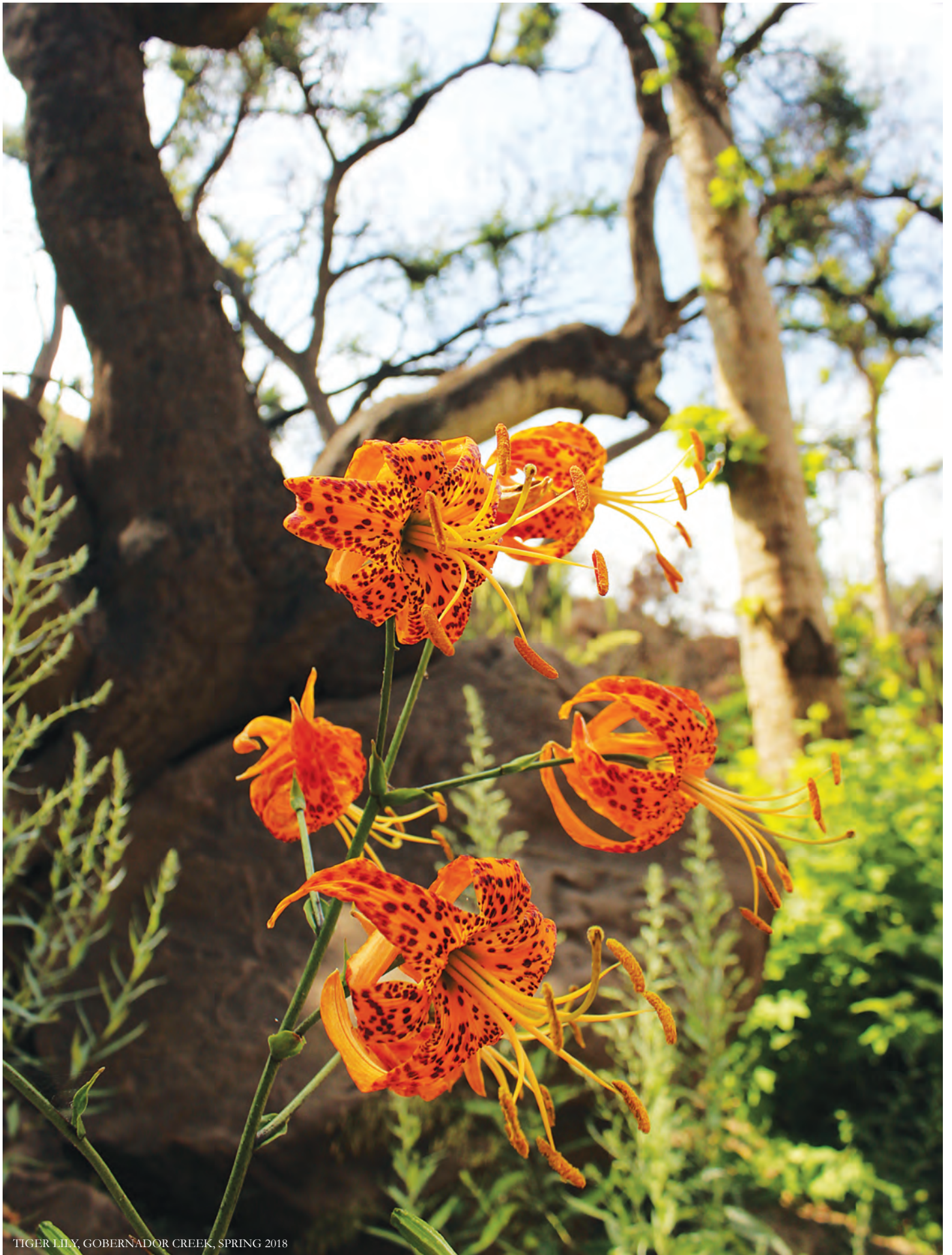
TIGER LILY, GOBERNADOR CREEK, SPRING 2018