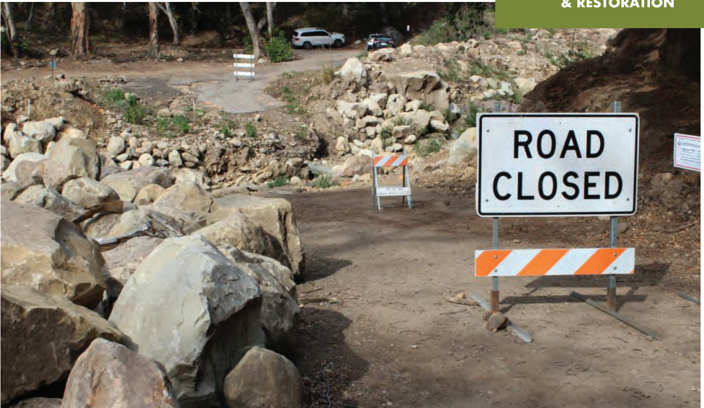
COLD SPRINGS TRAILHEAD, 2018