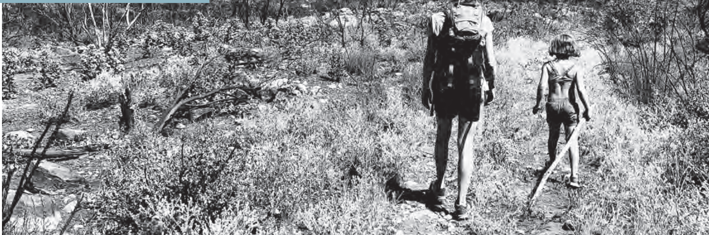
MATILIJIA CREEK, MAY 2018