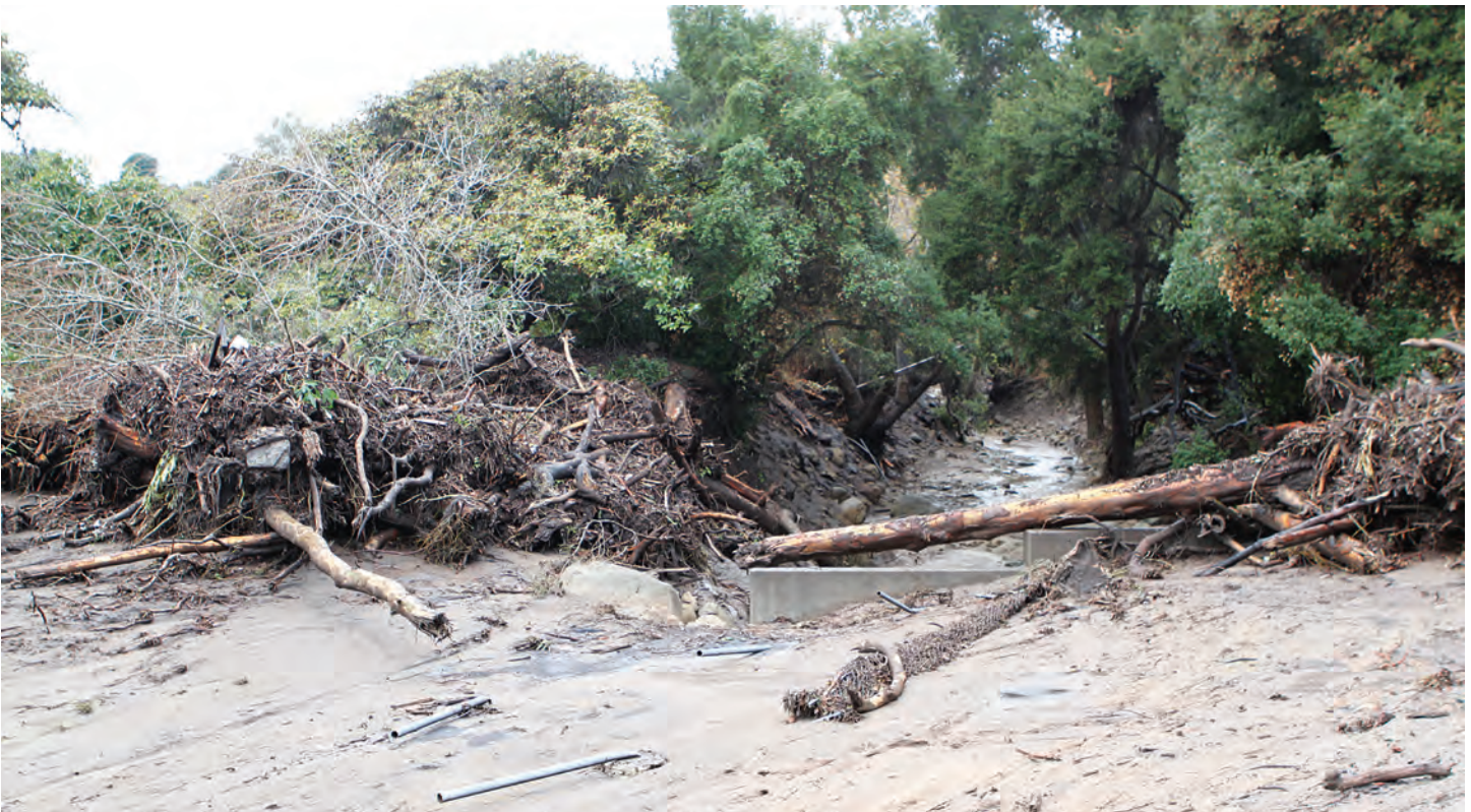
CARPINTERIA CREEK WATERSHED, JANUARY 2018

Note: High priority goals and objectives are indicated by an *.