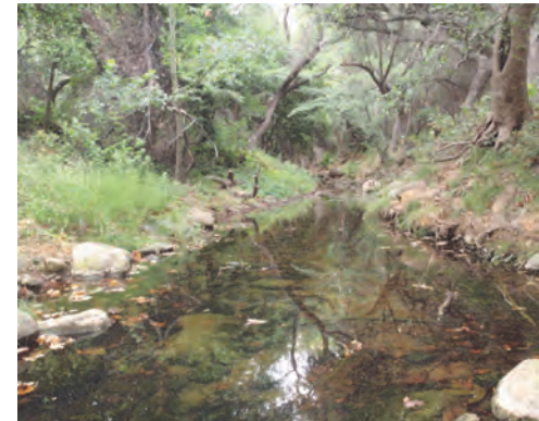
THE TAJIGUAS WATERSHED HAS A DENSE RIPARIAN CANOPY THAT PROVIDES HABITAT AND SHADING FOR STEELHEAD