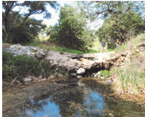
ONE OF FIVE CROSSINGS THAT WILL BE REMOVED THIS SUMMER FROM THE TAJIGUAS WATERSHED ON THE GAVIOTA COAST

For more information, check out our website schabitatrestoration.org