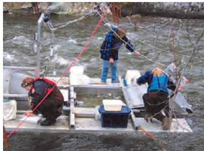
WSP MEMBER WORKING ON A ROTARY SCREW TRAP ON THE SHASTA RIVER