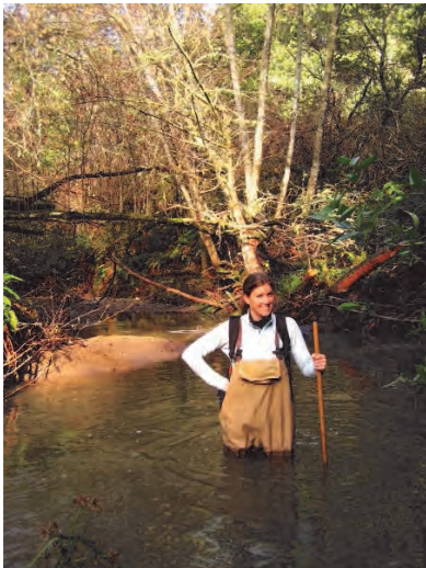
A COHO AND STEELHEAD SPawner SURVEY IN MARIN COUNTY

Each Watershed Stewards member is placed with an organization which is committed to preserving and restoring California's watersheds and native salmon runs, whether it is a Federal, State or County agency, Tribal department, or a grassroots-based non-profit. Watershed Stewards members work under the guidance of a natural resource professional at their placement site to fulfill the WSP mission and provide support for their site. Each site varies in the duties, schedule, and scope of work, however, all sites provide some amount of watershed assessment, education and outreach opportunities, and training opportunities for the AmeriCorps members. If you are interested in applying to be a watershed steward or if you are interested in more information about the project please check out watershedstewards.com .