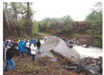
FILED TOUR OF RESTORATION SITES