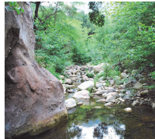
THE PERENNIAL HABITAT THAT WILL BE MADE AVAILABLE UPSTREAM OF THE CROSSING.