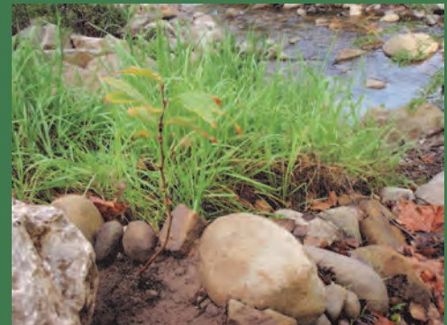
TWO OF THE TEN PORTOLA SYCAMORES PLANTED ALONG CARPINTERIA CREEK AT SCHR RESTORATION SITES

The Santa Barbara chapter of the Garden Club has propagated over a 100 sycamore trees from the historic Portola sycamore in Carpinteria. The large effort was undertaken as part of the Garden Club's 100 year anniversary. The Garden Club was generous enough to donate 10 of these trees to SCHR to plant at restoration sites along Carpinteria Creek. The sycamore trees were planted this March and are doing great.