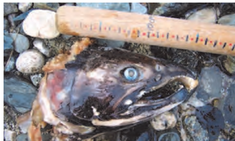
A WSP MEMBERS ON A SPawner SURVEY ON THE SCOTT RIVER FOUND A COHO CARCASS