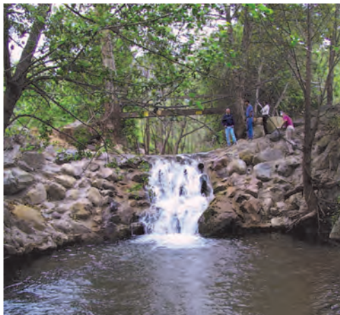
THE CURRENT WIDDOES CROSSING IS A COMPLETE BARRIER TO STEELHEAD PASSAGE.

For more information about the project, check out our website schabitatrestoration.org