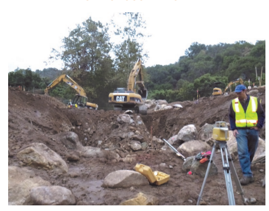
FROM THE DOWNSTREAM END LOOKING UPSTREAM SHOWS THE CONSTRUCTION OF THE NEW STREAM CHANNEL.