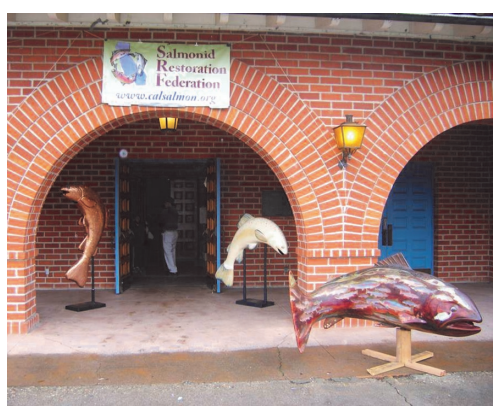
A PHOTO FROM THE 2011 SRF CONFERENCE IN SAN LUIS OBISPO

workshops and field tours on Wednesday and Thursday, followed by two days of concurrent sessions on Friday and Saturday. The conference will be held at the Santa Barbara Veterans Memorial Building, located at 112 W Cabrillo Boulevard in downtown Santa Barbara. Registration for the conference is currently open, reduced rates for early registration ends in February. Space is limited so register early. The full agenda for the conference has been posted. SCHR will be leading a field tour on Wednesday entitled Southern Santa Barbara Coastal Streams Tour: Fish Passage on Agricultural and Urban Stream, and on Saturday a presentation on steelhead recovery efforts in Carpinteria Creek. Visit calsalmon.org for more information and to register.