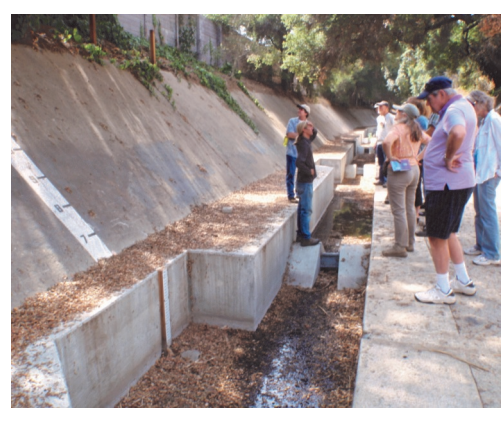
A FIELD TOUR OF THE MISSION CREEK FISH PASSAGE PROJECT

In addition SRF will host a workshop and training event next month in Ventura. The training will demonstrate innovative, technical methodologies in salmonid restoration to professional fisheries biologist and watershed restoration professionals. The training will be held January 14<sup>th</sup>-16<sup>th</sup>, 2014 at the Pierpoint Inn, in Ventura. The hands on workshop will assist engineers, hydrologist, planners and biologist in the design and implementation of fish passage projects. The workshop will cover the design and implementation process, including biological considerations, site surveys and geomorphic