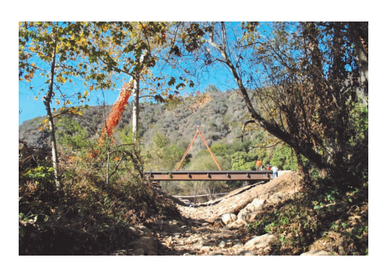
FROM UPSTREAM LOOKING BACK DOWNSTREAM SHOWS THE CRANE INSTALLING THE NEW BRIDGE ACROSS THE CREEK.

http://carpinteriacreekpinkham.blogspot.com/