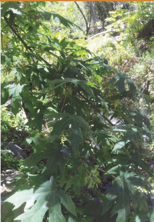
BIG LEAF MAPLE