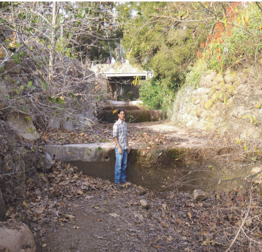
A PHOTO OF THE FISH PASSAGE BARRIER ALONG CARPINTERIA CREEK THAT WILL BE REMOVED

Service, California Fish Passage Forum, State Coastal Conservancy, and the property owners. SCHR is currently finalizing environmental permitting requirements and hopes to begin construction in August. Construction will be complete in October and re-vegetation efforts will begin with the onset of winter rains.