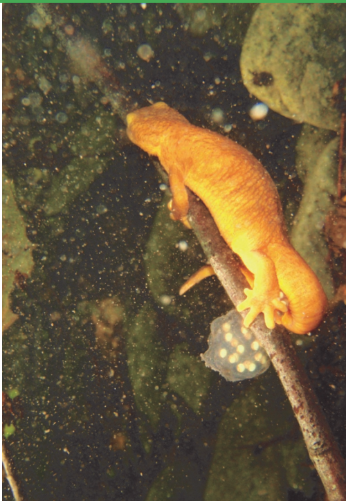
COAST RANGE NEWT AND EGG MASS