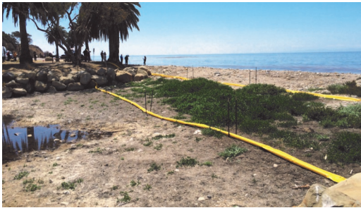
TOP RIGHT: OIL AT TAJIGUAS BEACH ON MAY 20TH, 2015. ABOVE: CONTAINMENT BOOMS DEPLOYED ACROSS THE MOUTH OF REFUGIO CREEK. BOTTOM LEFT: REFUGIO CREEK MOUTH RESTORATION SITE