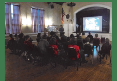
PREVIOUS COMMUNITY PRESENTATION HOSTED BY THE CCWC