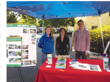
SCHR TABLING AT THE 2013 PATAGONIA SALMON RUN.

The 21 st Annual Patagonia Salmon Run will take place on Sunday November 9 th , at 8:30 am. The 5K race begins and ends at Patagonia's Great Pacific Iron Works, 235 W. Santa Clara Street, in Ventura. This year's event proceeds will benefit the Los Padres Forest Watch. After the race stay for the awards ceremony, a raffle with great prizes, refreshments and to learn about local environmental groups! SCHR will be there if you want to come see what we have been up to. For more information or to register for the race visit Patagonia.com .