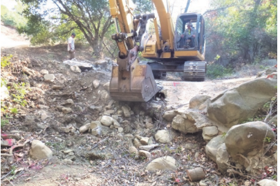
DEMOLITION OF THE CONCRETE CROSSING