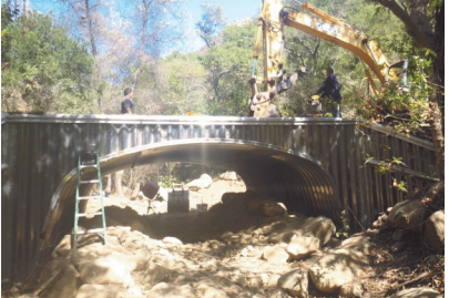
NEW ARCHED CULVERT INSTALLED IN ITS PLACE